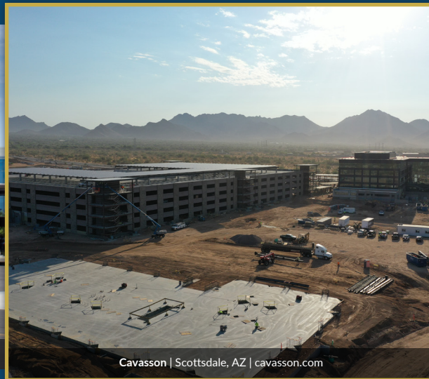
Cavasson | Scottsdale, AZ | cavasson.com