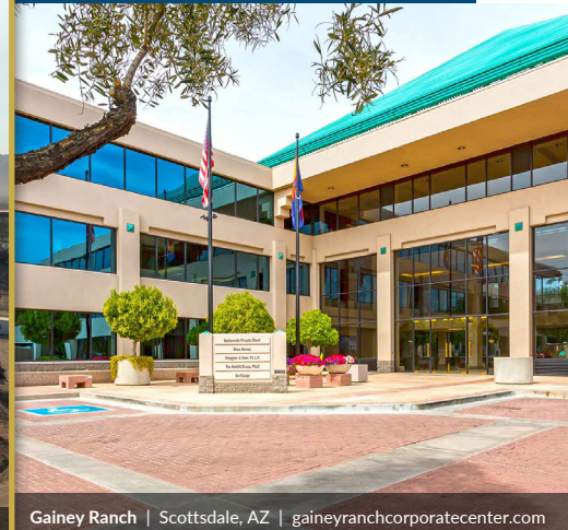
Gainey Ranch | Scottsdale, AZ | gaineyranchcorporatecenter.com