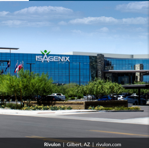
Rivulon | Gilbert, AZ | rivulon.com

Learn more at nationwiderealtyinvestors.com .